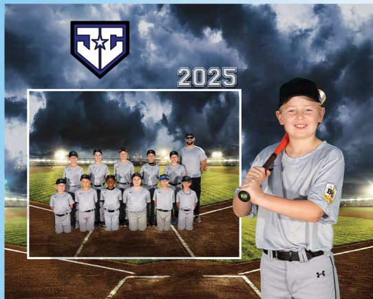
#1-Memory Mate $22.00